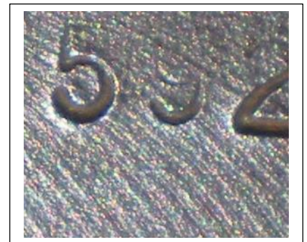
Light impact VIN stamp